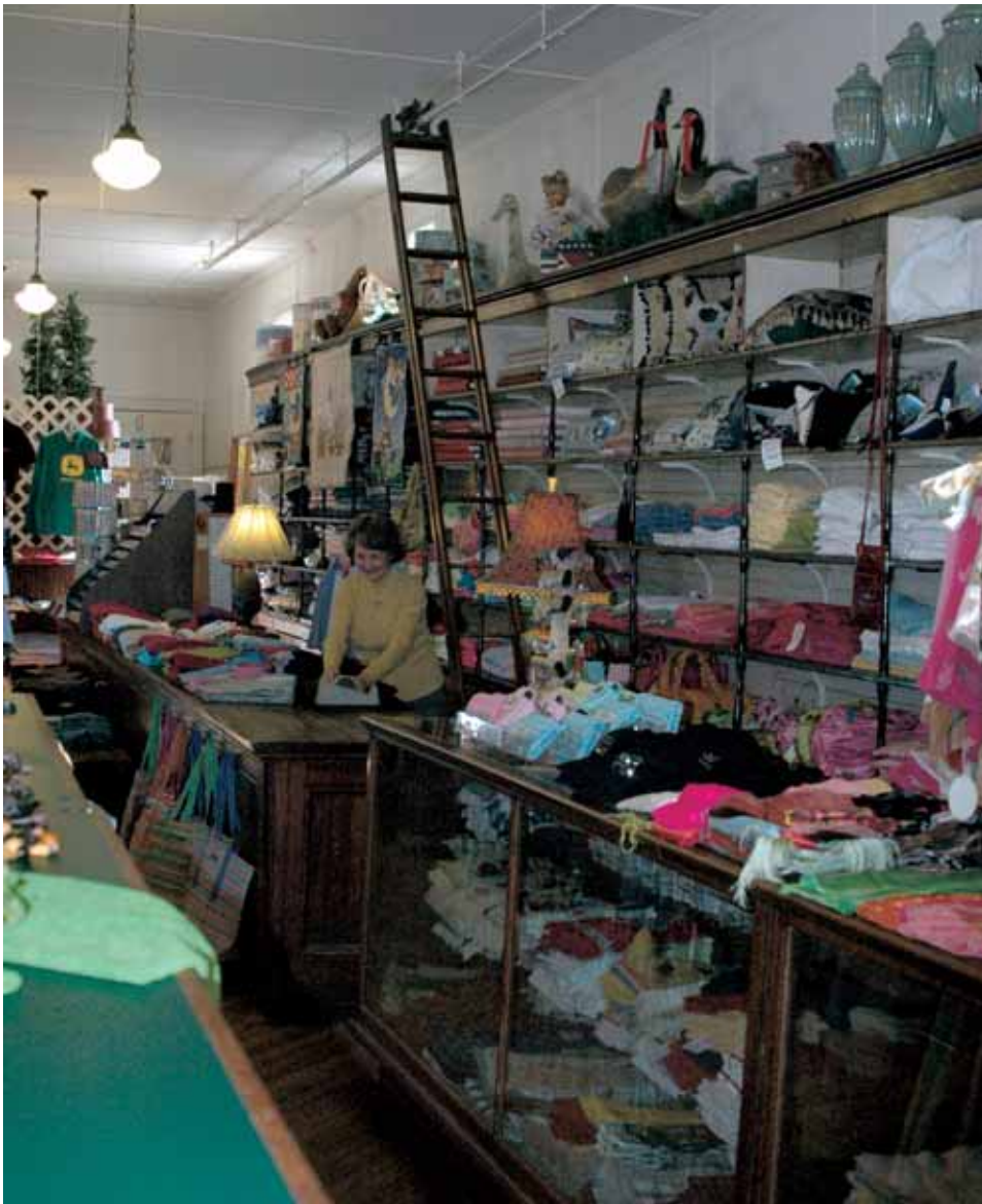
R. S. Bristow and Son, "Home of Good Goods," was founded in 1876 as a general mercantile store in town. Today, the store has become an upscale clothing and gift shop.