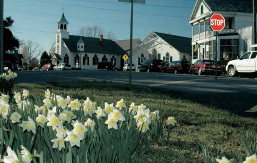
Daffodils announce the arrival of spring on Watling Street in Urbanna. Old Haywood's Store and the main portion of the Urbanna Baptist Church with its wonderful steeple were constructed in the late 1800s.