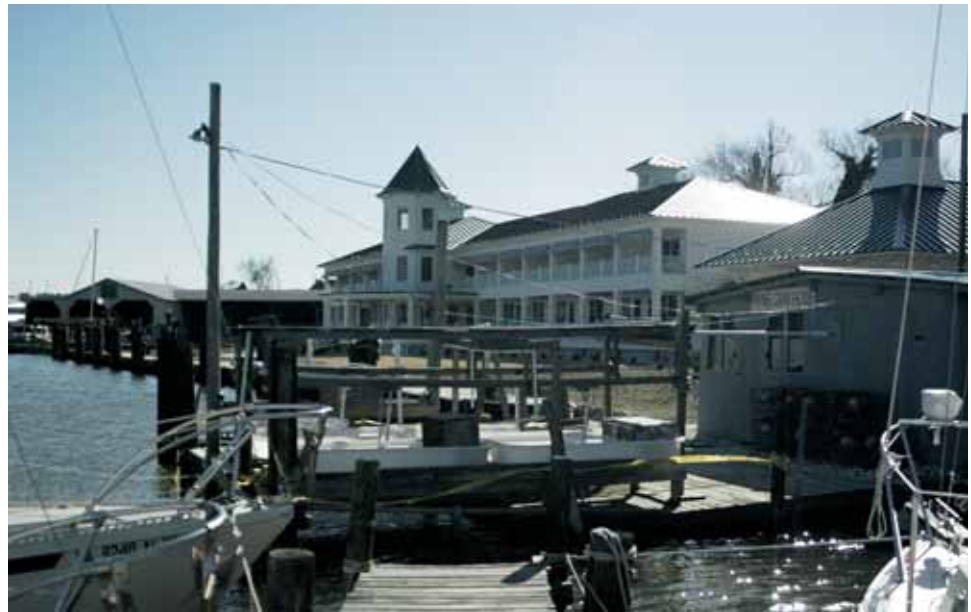
Liberty at Compass Quay opened this year on the waterfront in town. Right next door is Payne’s Crab House, a traditional soft-shell crab business.