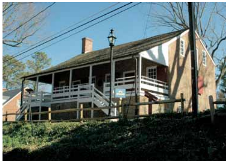
The Old Tobacco Warehouse on Virginia Street is one of several pre-revolutionary buildings in town. It now houses the Urbanna Visitors Center.

intended style: That of a quaint, small-town community that attracts more than 60,000 visitors to its annual two-day official state Oyster Festival the first weekend in November. More importantly, Urbanna is home to about 600 residents, many of whom are natives and others of whom have moved here to enjoy the relaxed, small-town lifestyle. What makes the town unique is that a visit by water can be as convenient as by automobile. The town-owned Urbanna Town Marina at Upton's Point has 16 transient boat slips, with a laundry and showers for overnight boaters. The facility is handicapped accessible. From the marina, a short walk up Virginia Street leads to the heart of the business and historical district in the town.