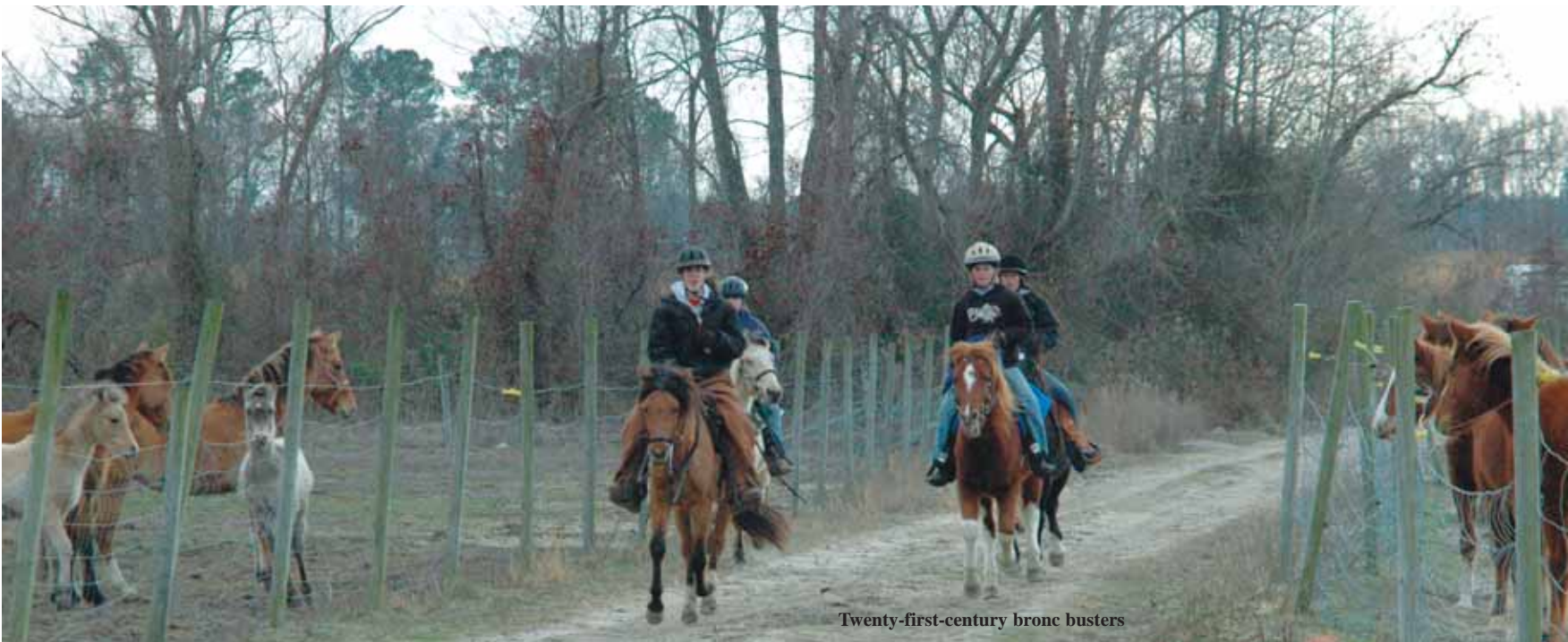
Twenty-first-century bronc busters