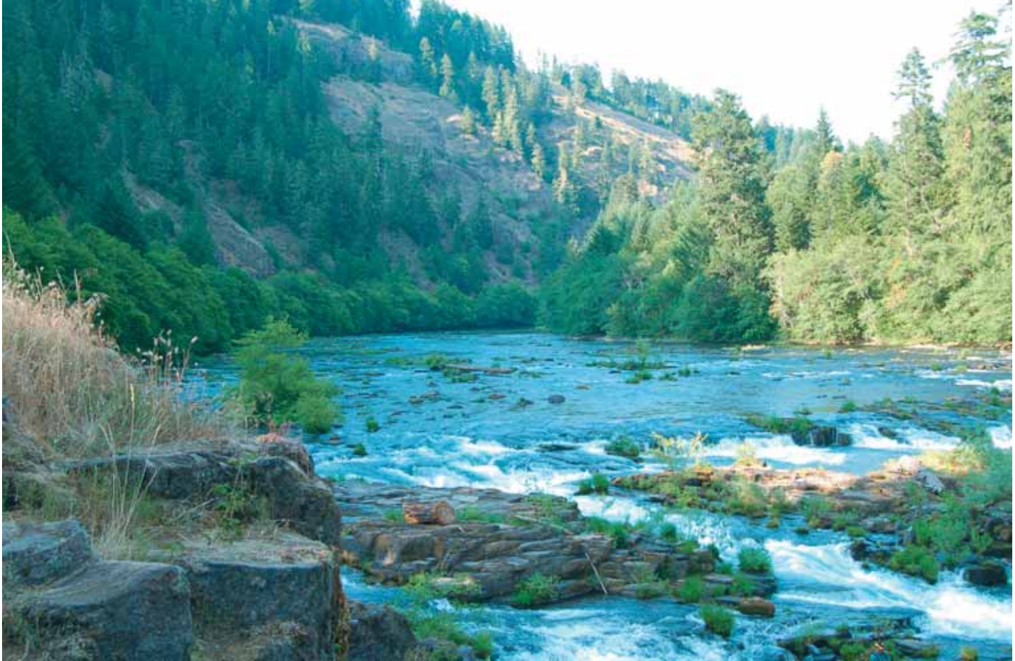
You never get tired of the rugged yet lush North Umpqua scenery.

disinherited him. After World War I, he moved to Catalina Island with his new wife and became a major player in the then-new technology of radio and as a writer of numerous stories about marlin fishing. His focus soon turned to catching the beautiful sea-run rainbow trout, better known as steelhead, on the North Umpqua.