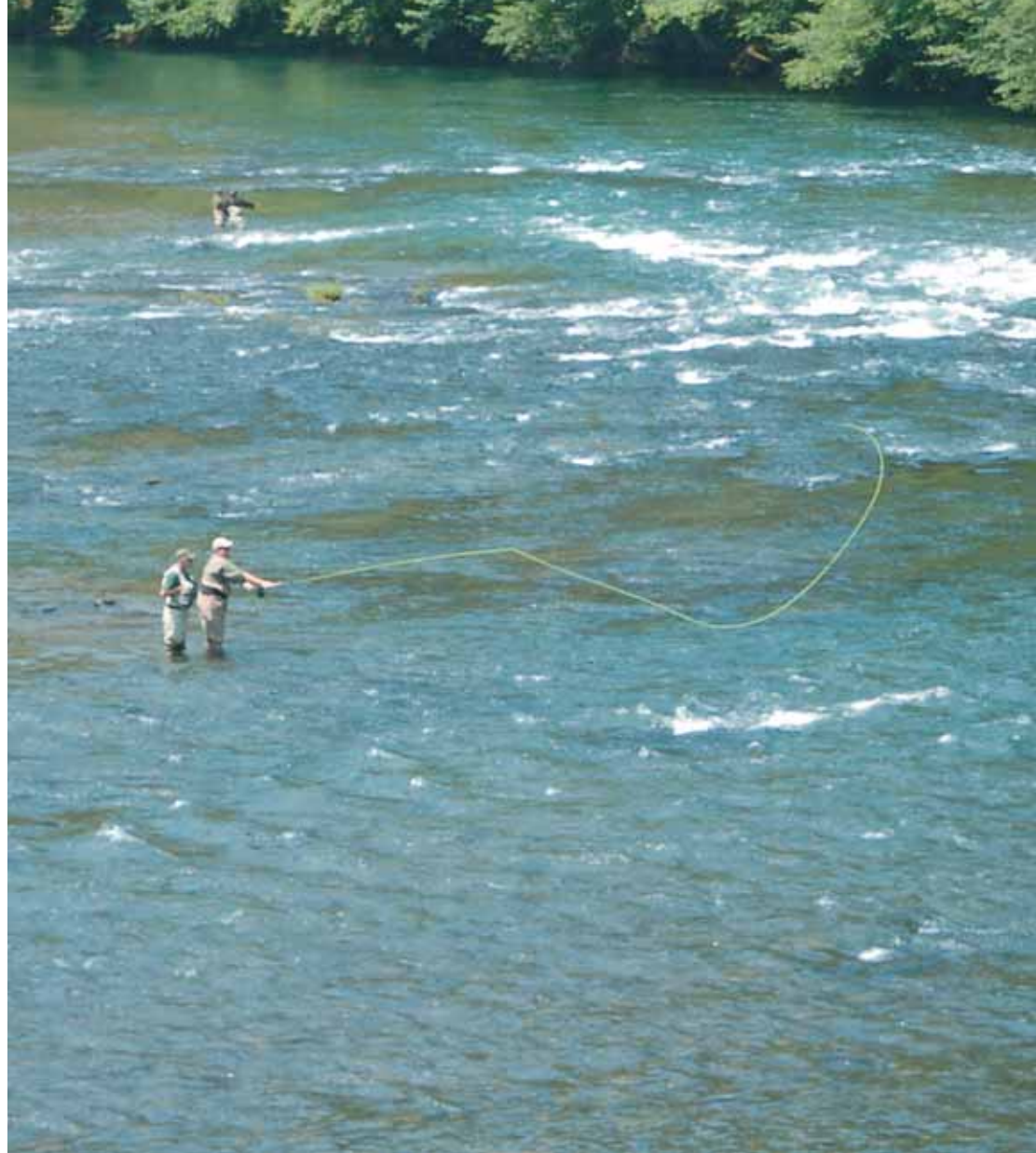
While the water looks shallow, it can be very deceiving and slippery. Steel-spiked boots are a must on the Umpqua.